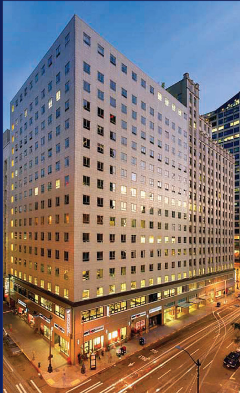
DOWNTOWN SEATTLE'S PREMIER MEDICAL & DENTAL OFFICE TOWER

For further information or to schedule a tour, please contact: