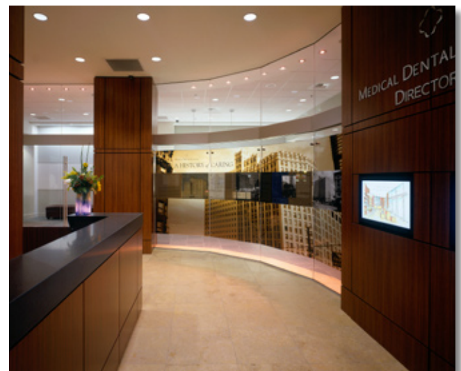
Recently Renovated Building Lobby